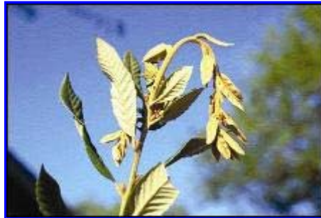
Figure 7. Stem dieback of Rhododendron sp. caused by P. ramorum .