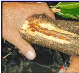
Figure 4. Bleeding canker symptom on coast live oak caused by P. ramorum .