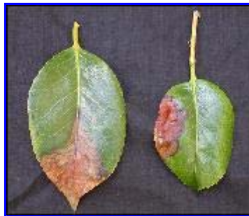
Figure 1. Leaf lesions on Kalmia latifolia (mountain laurel). Note the symptom occurs at the leaf tip, and the lesion has a water-soaked border.